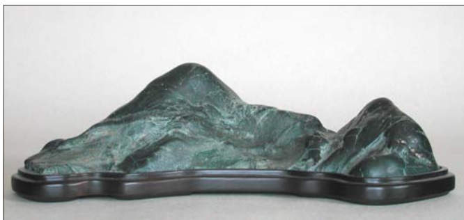
‘The Last Pass Before Home’, Eel River. This stone envelops one slightly while the lowest point invites us towards the pass between peaks. (cut)

When viewing a truly representational landscape stone, I believe most Western viewers seek a direct, objective recognition over or before subjective musings. Such apprehension of the stone may relate to a referential image, even one only ‘seen’ in photographs, or to their own experience. Beyond seeing a mountain, one seeks routes to penetrate it or climb towards its summit (above). When viewing a distant range one instinctively looks for the lowest point or gap denoting a potential pass through the mountains