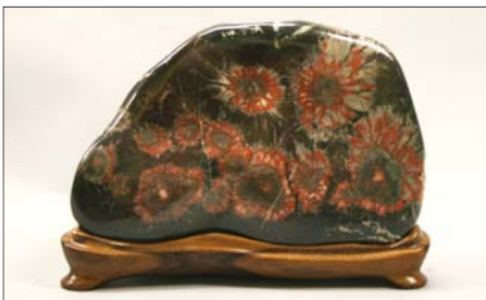
Bruce McGinnis 6 x 4 x 2