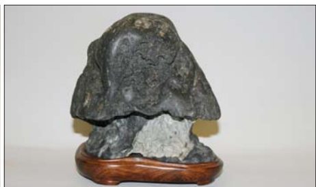
5 x 4.5 x 4

The 1 inch wide inner margins are designed for use with a 3 hole punch.