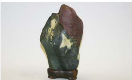
Bill and Lois Hutchinson 4 x 6 x 3