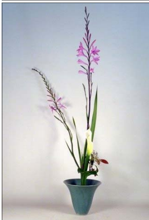
Ann's shoka shimputai

is simpler and emphasizes grace and flow.