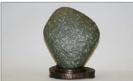
Buzz Barry 5 x 5 x 2.5