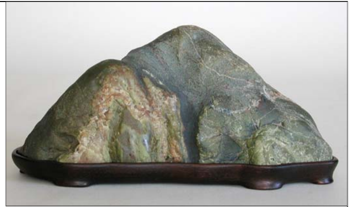
El Portal', Trinity River, Ken McLeod (AVSRC) The ends of this stone embrace us and the canyon is recessed providing, as its title suggests, a perfect 'point of entry'. (cut)

Unfortunately, because stones tend to round as they tumble, many, if not most stones, lack embrasure and, if anything, are more likely to have one or both ends curving back or running away from the viewer. With much chagrin, I find that less than 1% of our landscape stones have true embrasure and these are almost all the result of creative cutting, not natural formations! The idea of a visual point of entry may be seen as an extension of the concept of an inviting embrasure, and further, as an approach that circumvents or ameliorates the lack of embrasure in our many stones with broader bellies or retreating hips. Such stones may still have a low inviting opening/pathway that will visually invite exploration, enabling one to land safely on the shore of a cliff fringed island or ascend a mountain ravine. In rare cases, even a stone having well-curved ends may present a confrontational wall of steep, vertical edges or shoulders that create a visual barrier to 'getting into the stone'. If no point of entry exists along the baseline, perhaps the foreground may