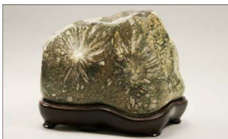
8.5 x 5 x 4