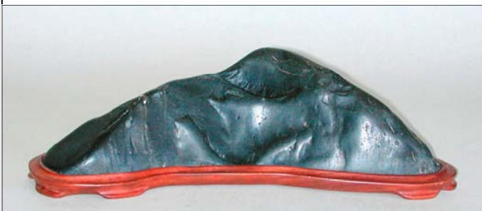
Kern River Stone, Elmer Uchida (AVSRC). This mountain invites the viewer on every level, having nice embrasure with an obvious point of entry into the valley in the center below the peak. Note that the peak also tips slightly forward. (cut)

identify the phenomenon of an enveloping, inviting form. The effect and importance of the presence or lack of embrasure will ultimately be subjective. Much will depend upon the type/classification of stone in question. Embrasure is not of much importance with color, pattern, and figure stones. It is largely of concern when dealing with landscape stones and, here, we are less concerned with ambiguous suiseki forms than with more naturalistic landscape stones. Even then, we are not generally concerned with stones representing relatively small features such as a coastal rock. We are concerned with those stones presenting ‘realistic’ images of mountains and grander ‘views’. Note that although the presence of embrasure might remain technically desirable and enhancing, when mountain views are truly distant, embrasure is not necessary for our acceptance of a view as ‘natural’.