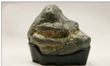
Larry Ragle's huts: 7 x 6 x 4