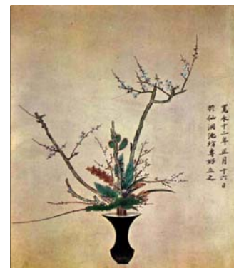
Rikka by Senke in 1635

Currently, Rikka has two forms; the classic form is Shofutai (below left), while Shimputai (below right) was only introduced in 1999. Shimputai means fresh wind. It