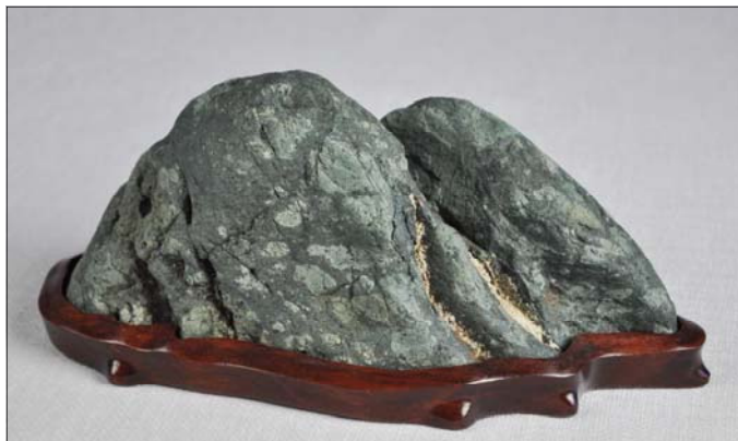
“Twins” Double-peaked Mountain Stone (Soho-seki). Collected by Rick Stiles, North Fork Teanaway River, Washington State, 2009 24cm x 10cm x 11cm (in inches: 9.4 x 3.9 x 4.3) Black walnut daiza .