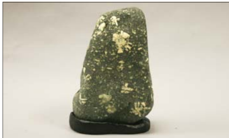
3.5 x 5 x 2