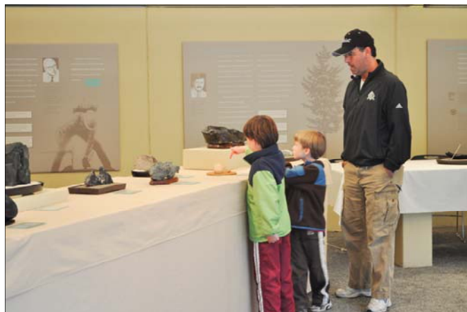
Young visitors learn about suiseki