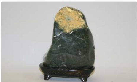
4 x 5 x 2.5