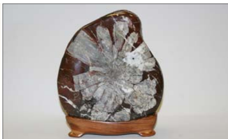
6 x 6 x 3