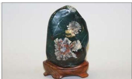
2.5 x 4 x 3