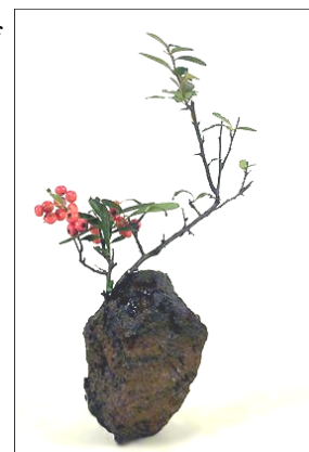
Freestyle with Yuha stone