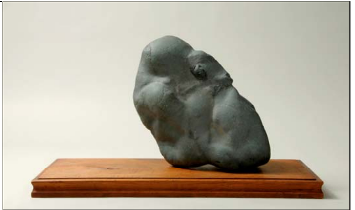
6. Moon-gazing Rabbit, Eel River, CA; Elmer Uchida (AVSRC) 10¼" W x 11¼" H x 4½" D (26cm x 28.6cm x 11.4cm) Many Asian myths say that rabbits procreate by gazing at the moon.