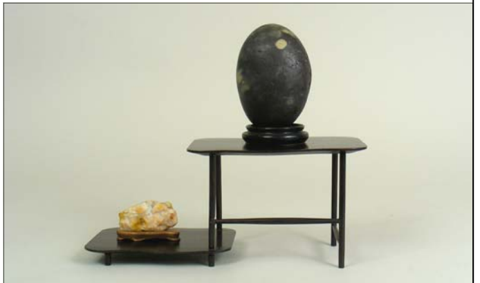
8. Rabbit and moon