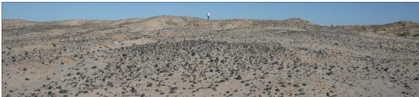
[Above] One lone seeker on the horizon. There's lots of room to spread out in the Yuha. [Below] Food and fellowship makes the day complete. If you didn't make it this time, join us for the next trip. You won't be sorry...it's all the fun!