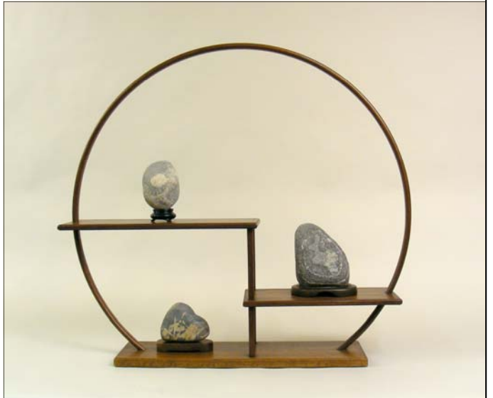
7. Rabbit with spring flowers and moon