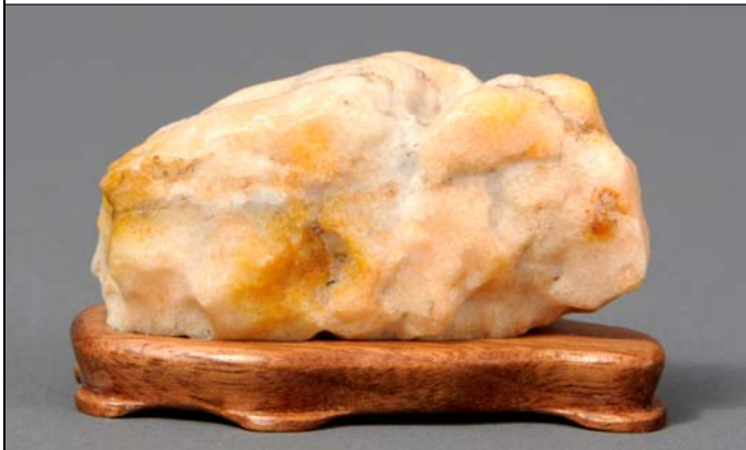
5. Palm Springs, CA; Jim Greaves (AVSRC) 2¼" W x 1¼" H x 1" D (5.7cm x 3.2cm x 2.5cm) A small, bright mimetolith.