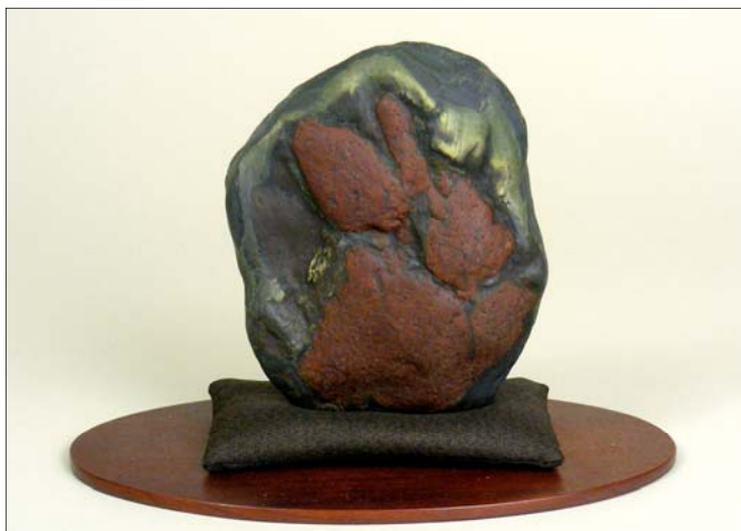
2. 'Strawberry Rabbit', Trinity River, CA; Ken McLeod